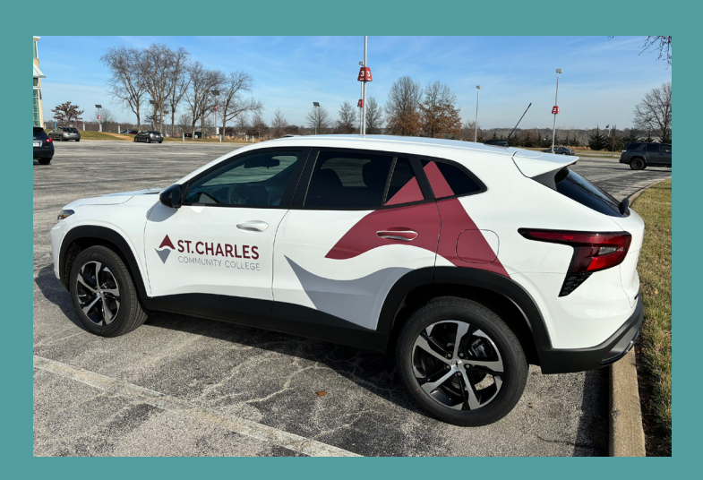
You may see their new, SCC branded car around town.

The team did over 90 college/career fairs and high school visits in the fall of 2023, including Cardinals Career Day at Busch Stadium, and the Amazon Distribution Career Choice Event.